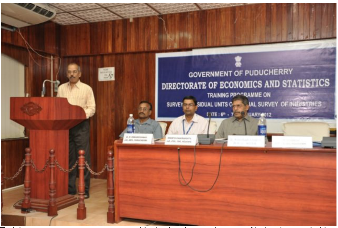
Training programme on survey on residual units of annual survey of industries was held on 6 &7 February 2012, of Puducherry